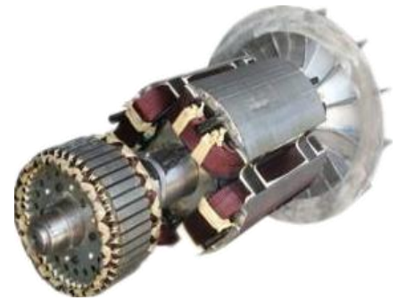
Big Shaft & Copper Wire

www.emeanpower.com Email: sale5@fjepos.com Phone: +86 19890349907